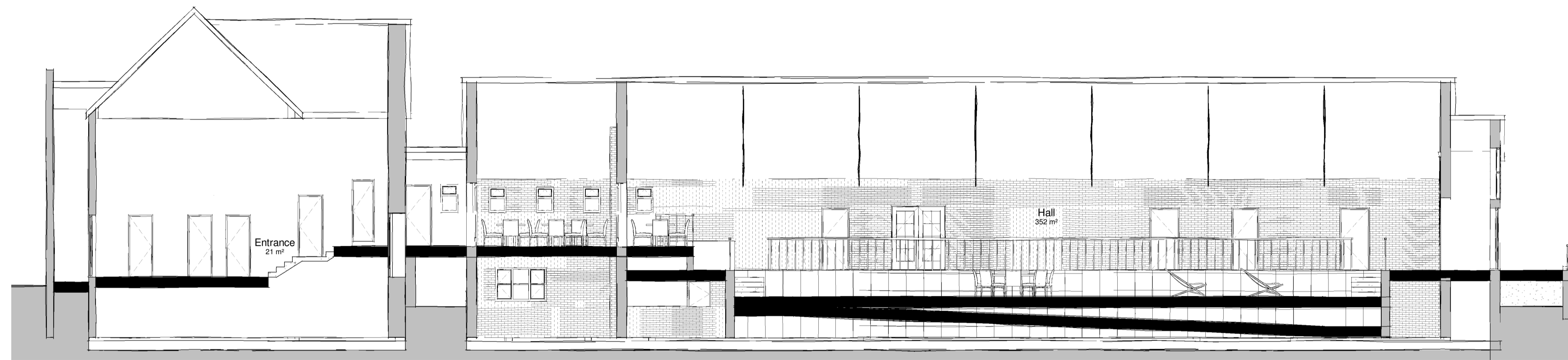
Section 3 1 : 100